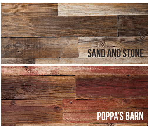
SAND AND STONE