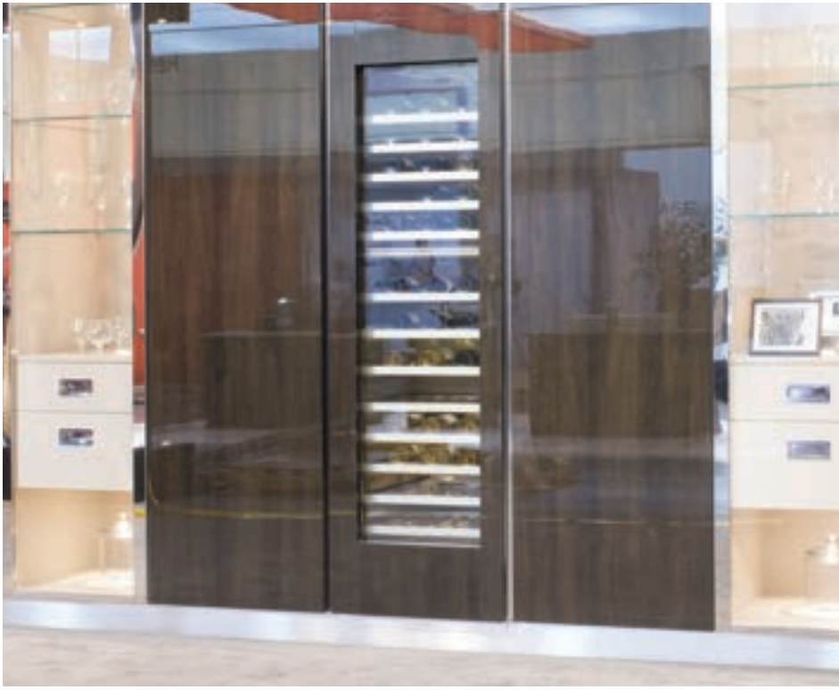
ROVERE GRIGIO HG INDH2HG