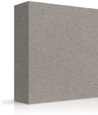
Smokey Mountain Pro 520Z