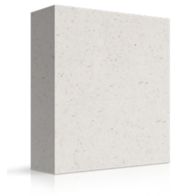
Jasmine Pro 532Z