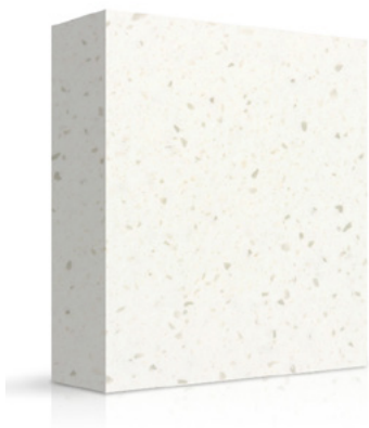
Blanca Pro 701Z