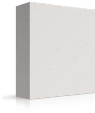
Chamomile Pro 737Z